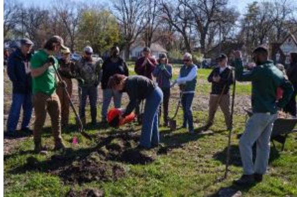
Fruit tree planting at DPFLI.

Enjoy your time with the youth and listen, you may learn something new and interesting.